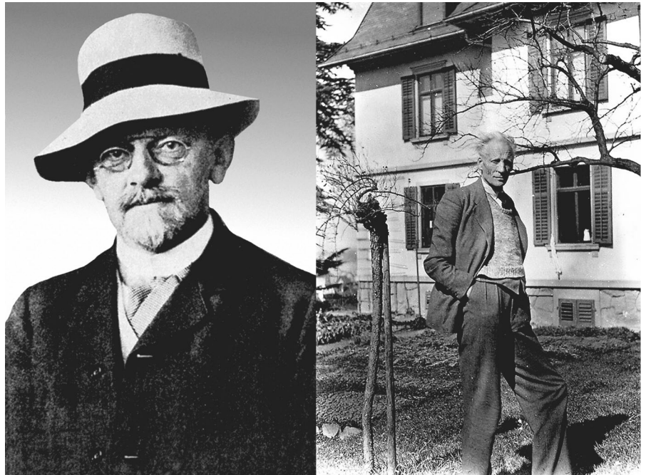
Fig. 1 | Debating mathematicians. David Hilbert (left), supporter of axiomatic mathematics. L. E. J. Brouwer (right), proposer of intuitionist mathematics.